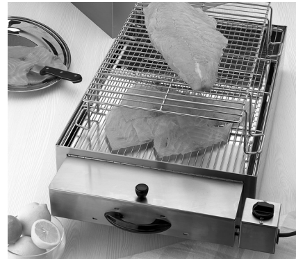
FM-4 - ROBUSTO 120 V