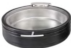
Radiance All Glass Cover 6 Qt. Round Buffet Chafer SKU: 2572-6/38, 2572-8/38

Scan QR code with your phone to watch the video.