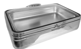
Radiance All Glass Cover 10 Qt. Full Size Buffet Chafer SKU: 2571-6/11, 2571-8/11