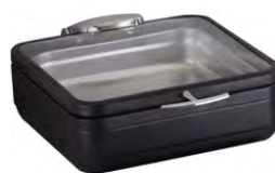
Radiance All Glass Cover 6 Qt. Square Buffet Chafer SKU: 2574-6/23, 2574-8/23