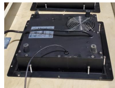
Figure 2. Induction Range & Mounting Bracket with Leveling Screws