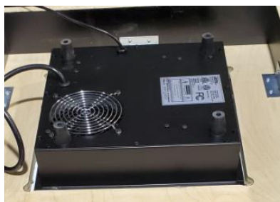
Figure 1. Induction Range Placed in Cutout