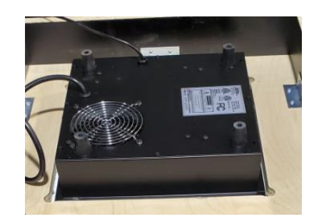
Figure 1. Induction Range Placed in Cutout

3. Install the (8) M5 x 4 5mm leveling screws provided.