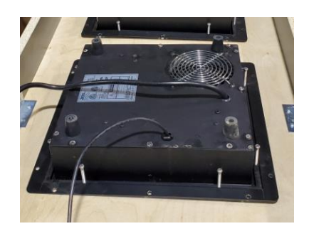
Figure 2. Induction Range & Mounting Bracket with Leveling Screws

3. Install the (8) M5 x 4 5mm leveling screws provided.