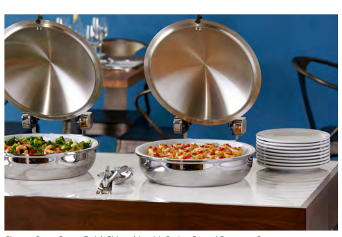
Shown: SmartStone Quick Ship table with Spring Round Sauteuse Server.