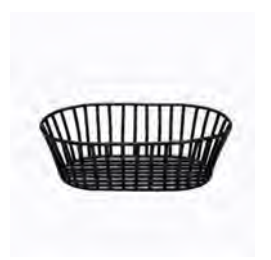
Oval Matte Black Wire Basket