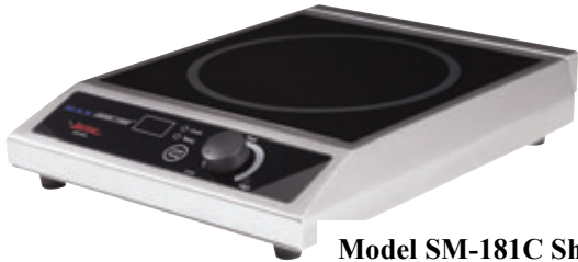
Model SM-181C Shown