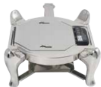
Figure 6. Adapter Frame Placed in Stand

Place the server on the stand being sure to align the support stabilizer bar and bumper with the stabilizer surface found in the back of the stand. The bumper should seal to this.