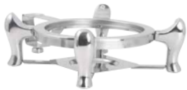
Figure 3. Stand

If using the full size, round or square server with an electric heating element, a stand and adapter frame are required. See Figure 3 and 4 for reference.