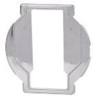
Figure 4. Adapter Frame

Be sure the stand is in a flat, level position. Place the electric heating element inside the adapter. See Figure 5 for reference. Fit the adapter frame inside the middle of stand so it is suspended above the canned fuel holder. See Figure 6 for reference.