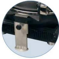
Figure 2. Support Stabilizer Bar Extender

A support stabilizer bar extender should be used when the bumper cannot reach the surface. See Figure 2 for reference.