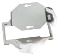
Figure 5. Heating Element in Adapter Frame

Be sure the stand is in a flat, level position. Place the electric heating element inside the adapter. See Figure 5 for reference. Fit the adapter frame inside the middle of stand so it is suspended above the canned fuel holder. See Figure 6 for reference.