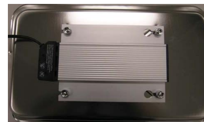
Figure 2. Electric Heating Element, Mounted Alignment

Slide the heating element in the corresponding direction that aligns the bolts with the narrow slots on the element. See Figure 2 for reference.