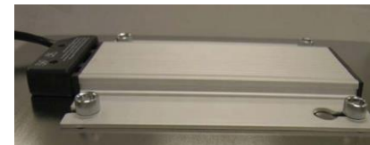
Figure 1. Electric Heating Element, Flat Side Down

To attach Spring USA's electric heating element for rectangular chafing dishes, model #9517, align the bolt holes on the element with the bolts located on the underside of the water pan. The flat side of the heating element should be touching the underside of the water pan. See Figure 1 for reference.